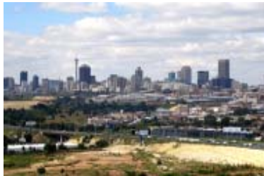
Johannesburg is the Largest City in South Africa

South Africa, the world's largest producer of platinum, gold, chromium, is a middle-income, emerging market with an abundant supply of natural re-