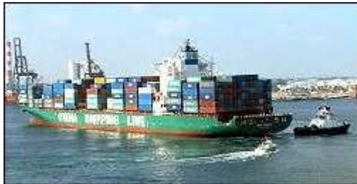
Ship entering Dongjigang Bonded Harbor Area

With the State Council's permission, Tianjin's Dongjiang Bonded Har-